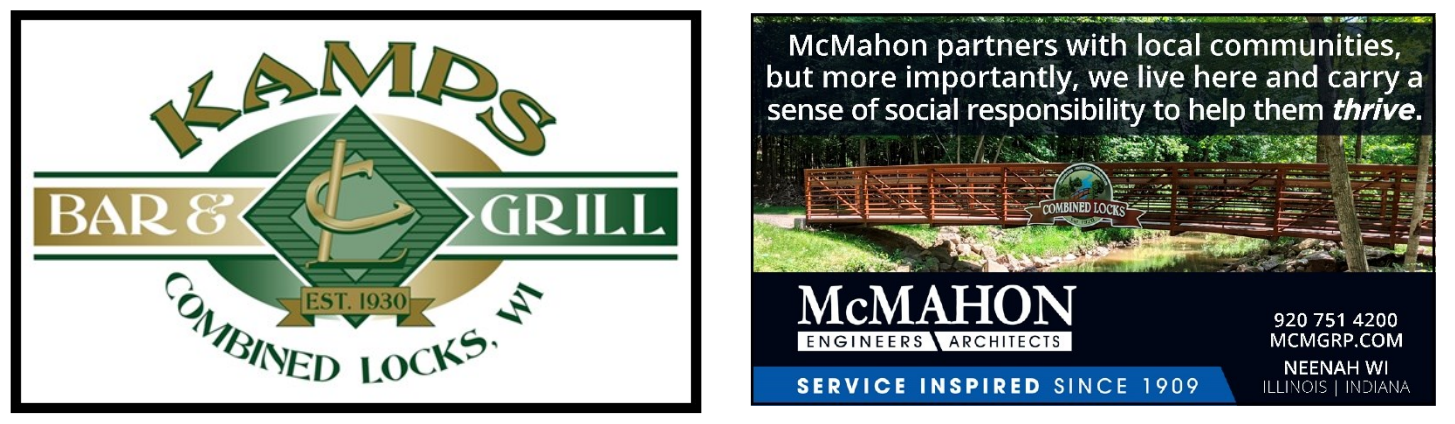
We hope you continue to patronize the local businesses that choose to advertise with the Village of Combined Locks. Their business cards are printed throughout the newsletter. The Village is grateful for their support.

I understand that Cars are not allowed to be driven on or be parked on the grass. The park must be vacated by 10:30PM. There are no exceptions to this rule. Loud and unnecessary noise is prohibited per Village ordinance 9.06. Noise that disturbs the peace and quiet of adjacent property owners will not be tolerated.